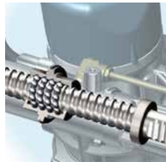
Rack & Pinion-Steering